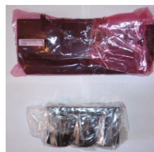
Entire battery bagged.